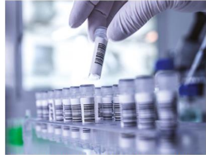
The Spectrum 10K study aims to collect DNA from 10,000 autistic people and their families.